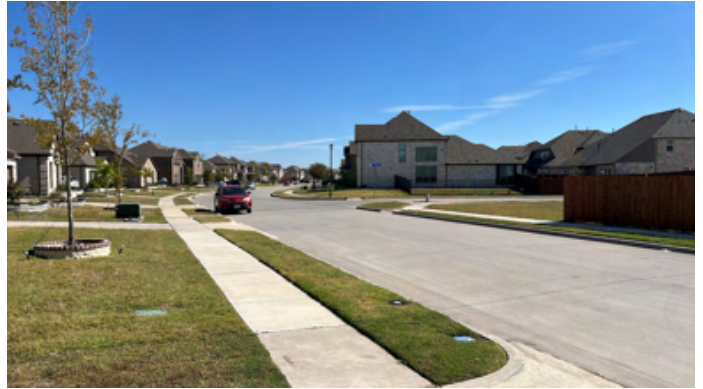
STREET VIEW LEFT