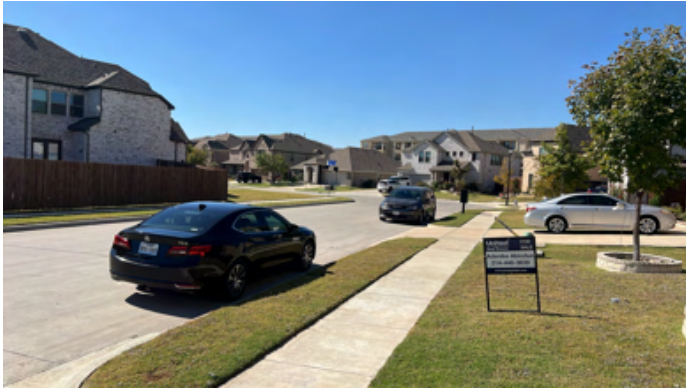
STREET VIEW RIGHT